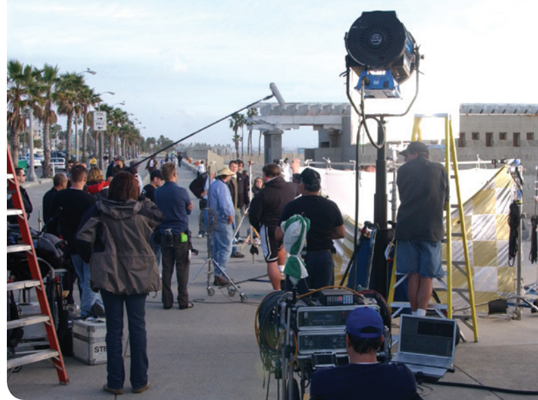
California's movie and video industry employment Primary establishments and independent production

California finally passed a film incentive program in 2009 (though it is more restrictive than other states' programs and specifically excludes big-budget films). Early data from FilmL.A., which coordinates permits for on-location shooting, shows a solid increase in production days in Los Angeles for the first two quarters of 2010. This fledgling rebound is attributable to both the new state incentives and general economic recovery from the slump of 2009. It's a positive sign—but it would be premature to conclude that the battle is won.